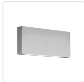
AT6610-BN Brushed Nickel